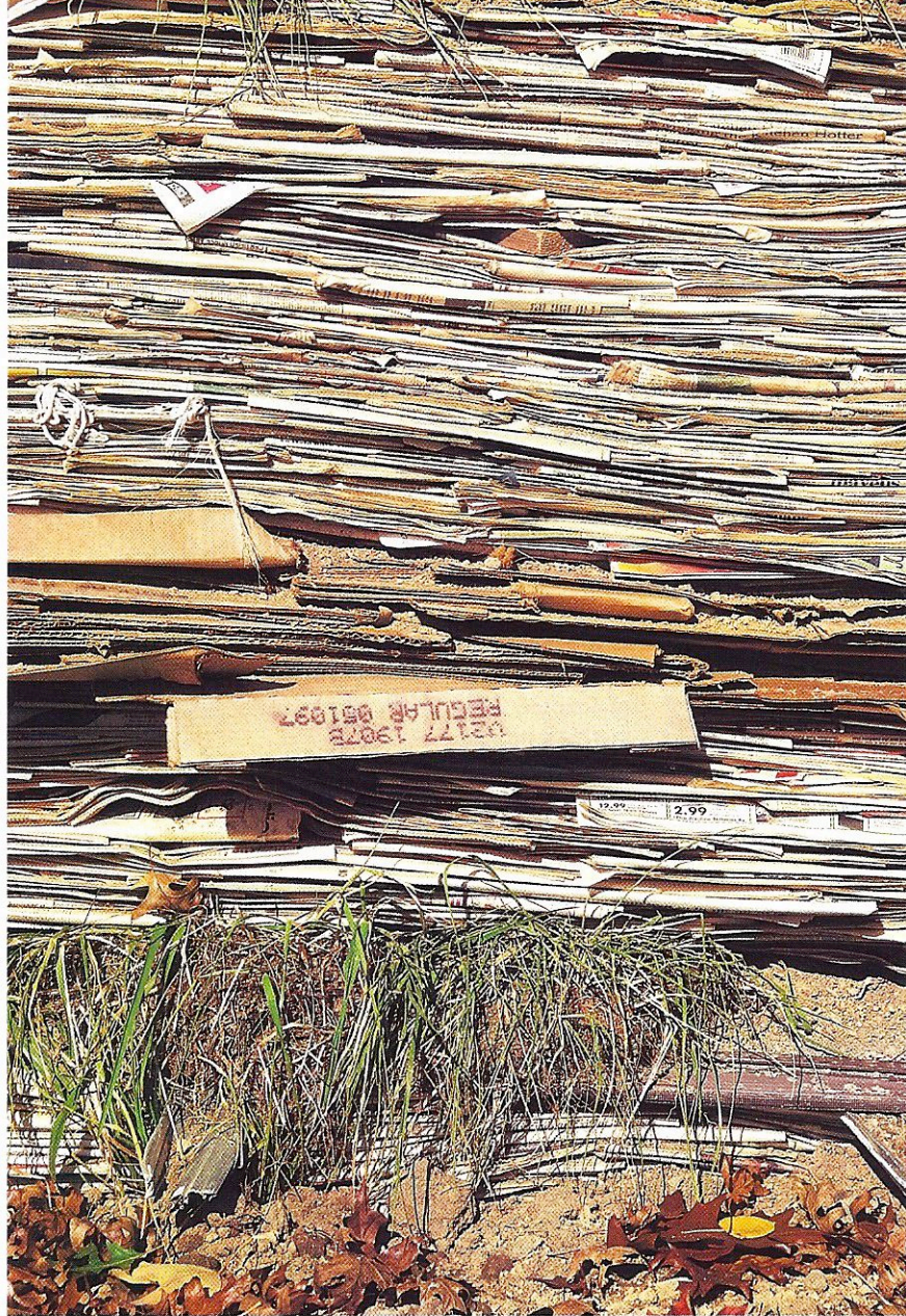
Holocene New Paltz (detail), 1992. Paper and discarded construction materials, work now destroyed.

as a vector leading toward colder climates and more complex life, and fueled by occasional catastrophes, against Lyell's vision of a world in constant motion, but always the same in substance and state, changing bit by bit in a stately dance toward nowhere." 3